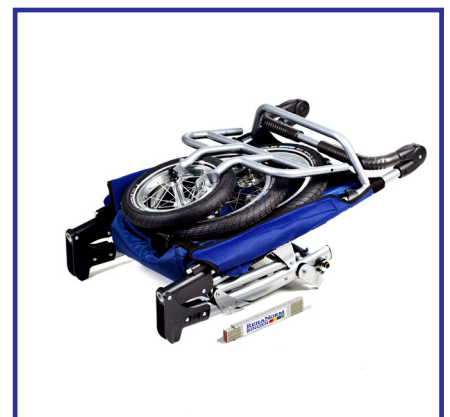
And folded the entire Multiroller is very small