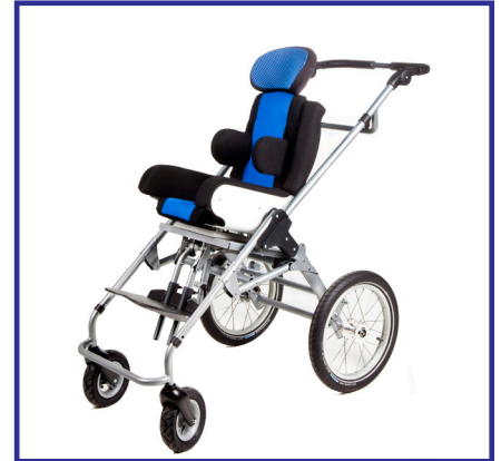
With seat shell, foot rest 2, and jogger set