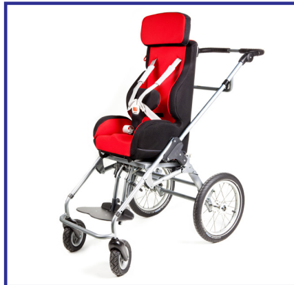
With car seat Tony Plus, foot rest 2, and buggy set