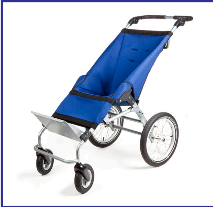
With sling seat, foot rest 1, and buggy set