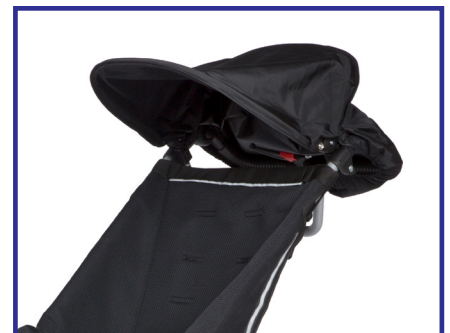
... with many accessories