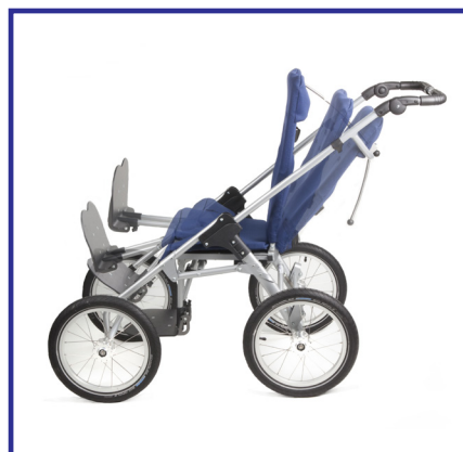
... on different positions