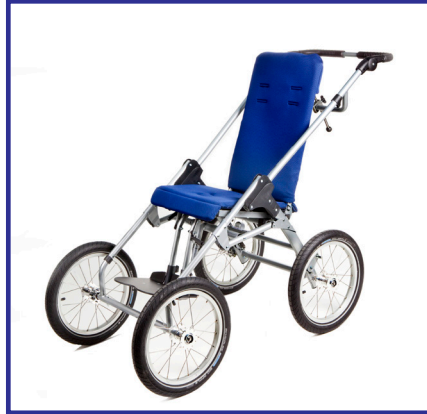
With seat frame, foot rest 2, and offroad set