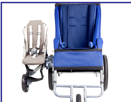
With Buggy Pod for a second child,