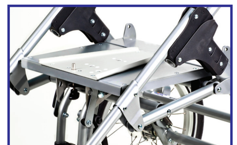
Seat shell adaptor