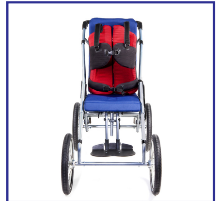
Also with corset