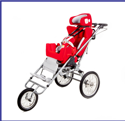
With Carrot 3 car seat and offroad set