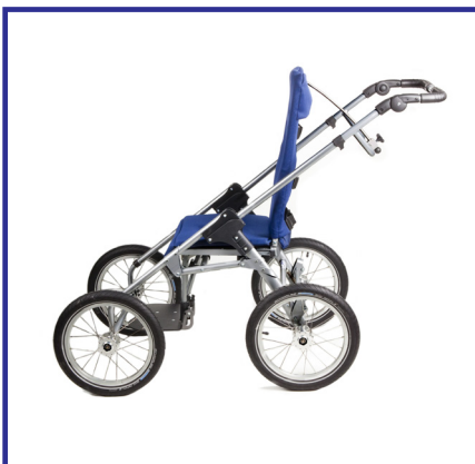
Seat frame ...