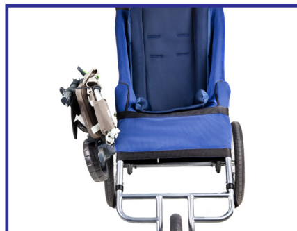
... which can be folded