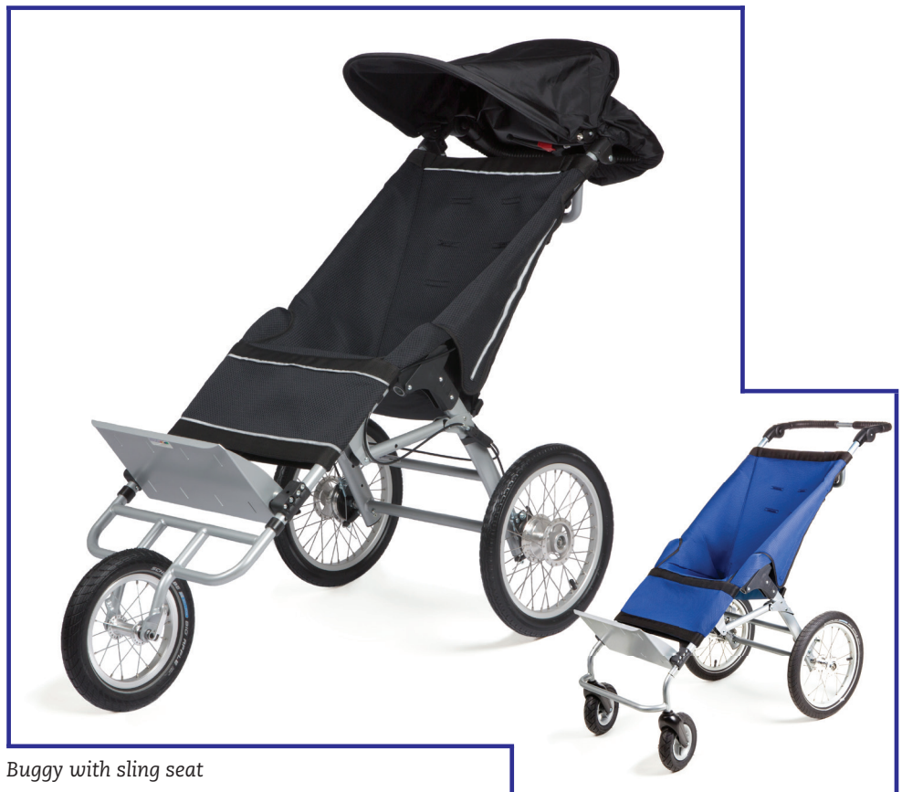
Buggy with sling seat

This flexibility gives many advantages. For example: During holiday travel the combination of a Multiroller and a Carrot car seat makes it ideal for any transportation.